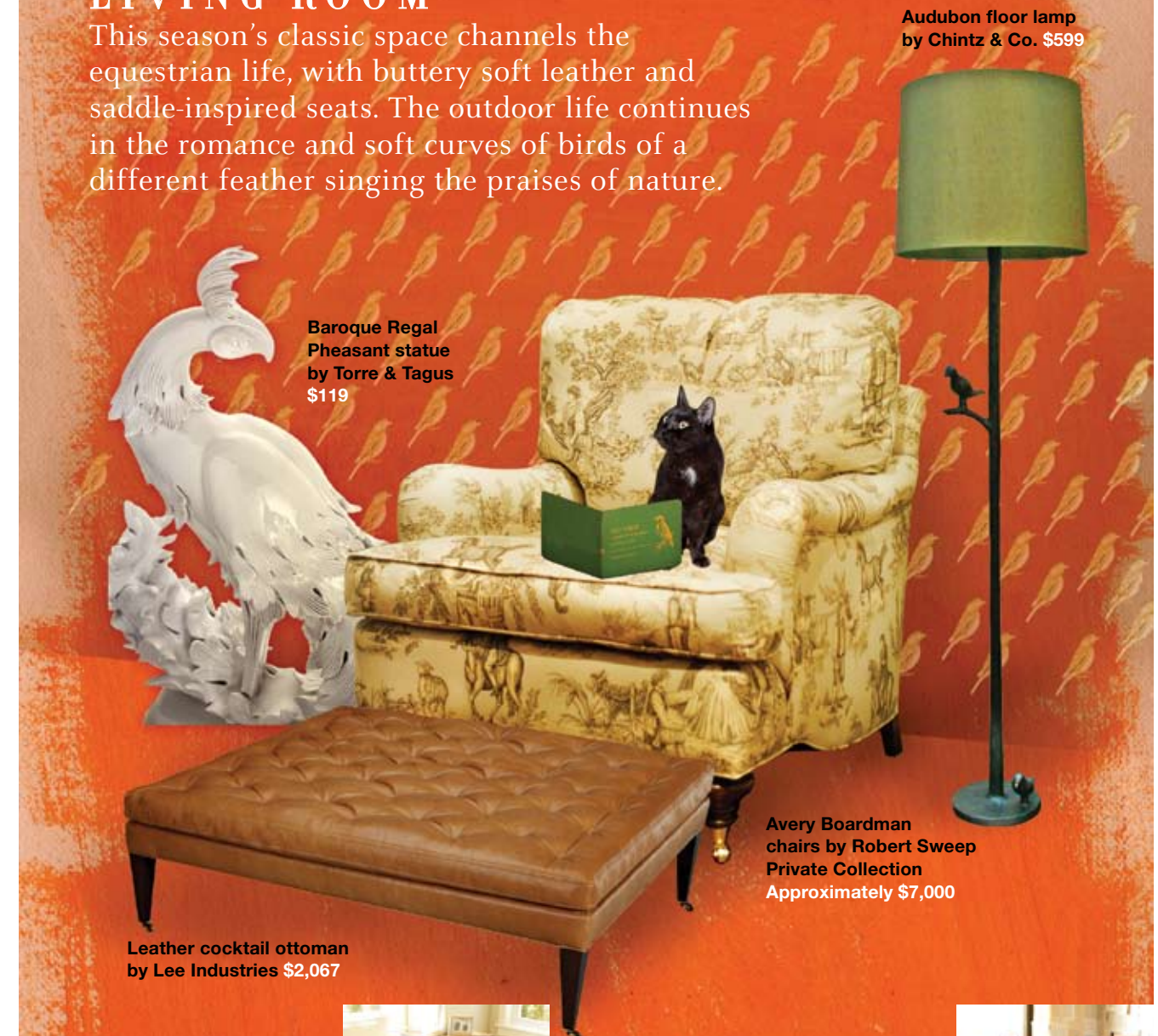
Audubon floor lamp by Chintz & Co. $599

This season's classic space channels the equestrian life, with buttery soft leather and saddle-inspired seats. The outdoor life continues in the romance and soft curves of birds of a different feather singing the praises of nature.