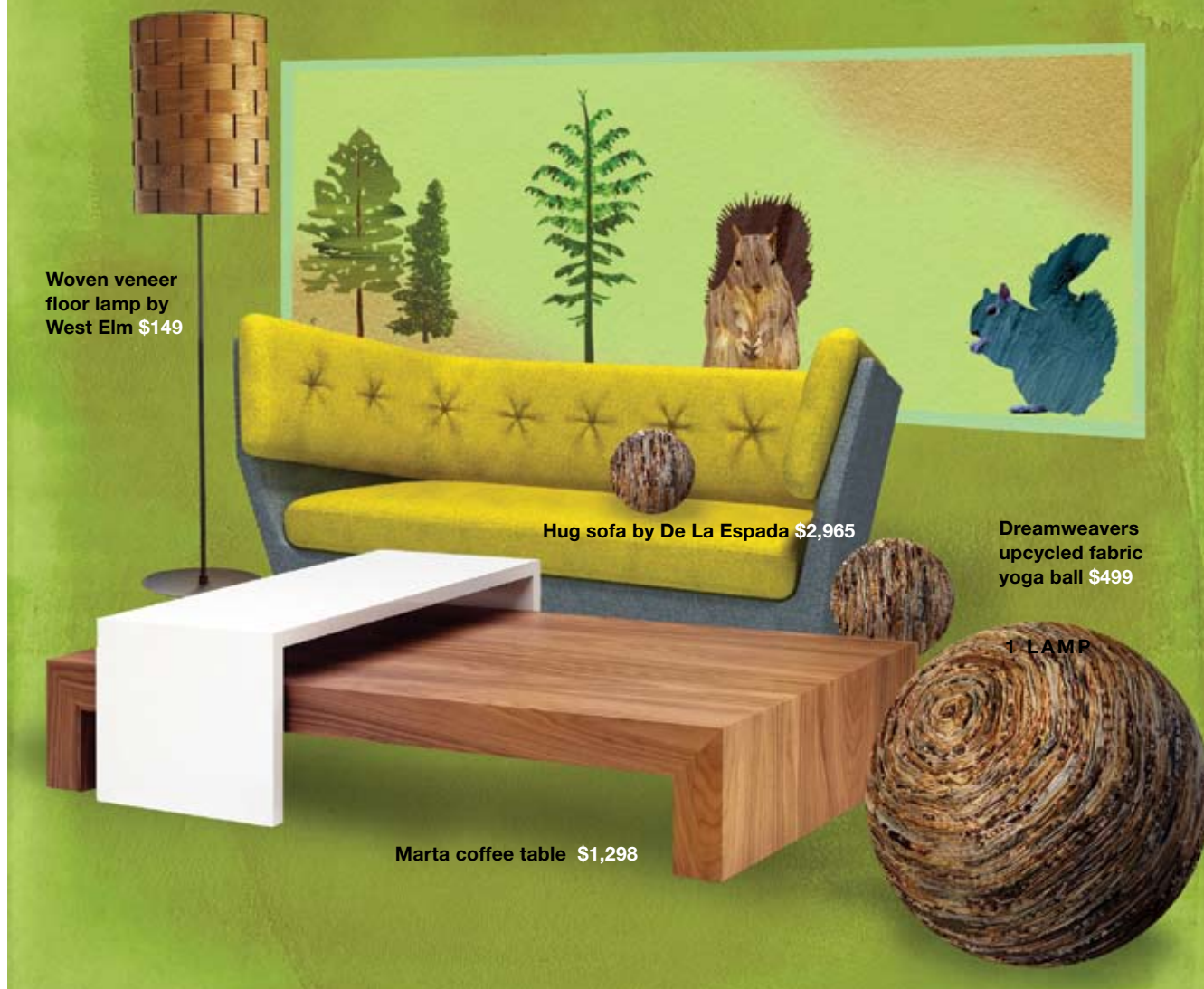
Woven veneer floor lamp by West Elm $149

If your sofa evokes a cozy sweater and your carpet a thick blanket, you've nailed the new fall look. Warm colours and organic textures inform the accessible modern living room.