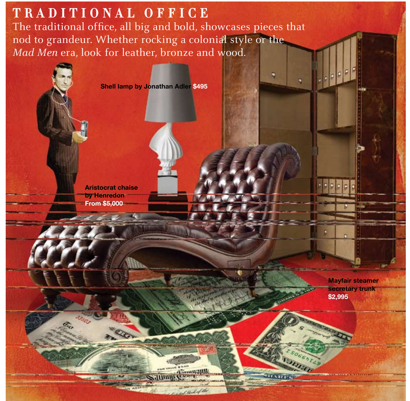
Mayfair steamer secretary trunk $2,995