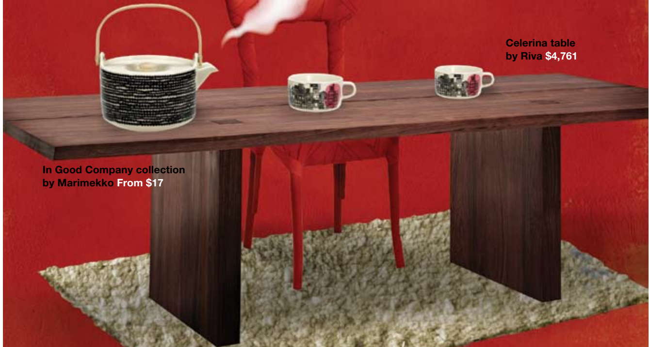
In Good Company collection by Marimekko From $17