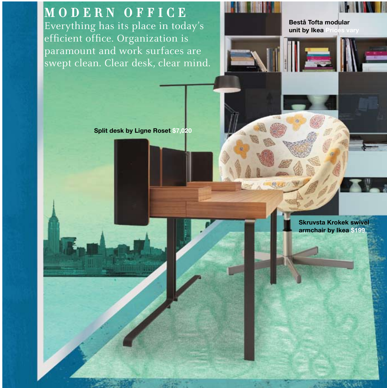
Skruvsta Krokek swivel armchair by Ikea $199