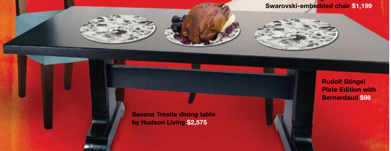
Rudolf Stingel Plate Edition with Bernardaud $98